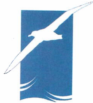
Agreement on the Conservation of Albatrosses and Petrels